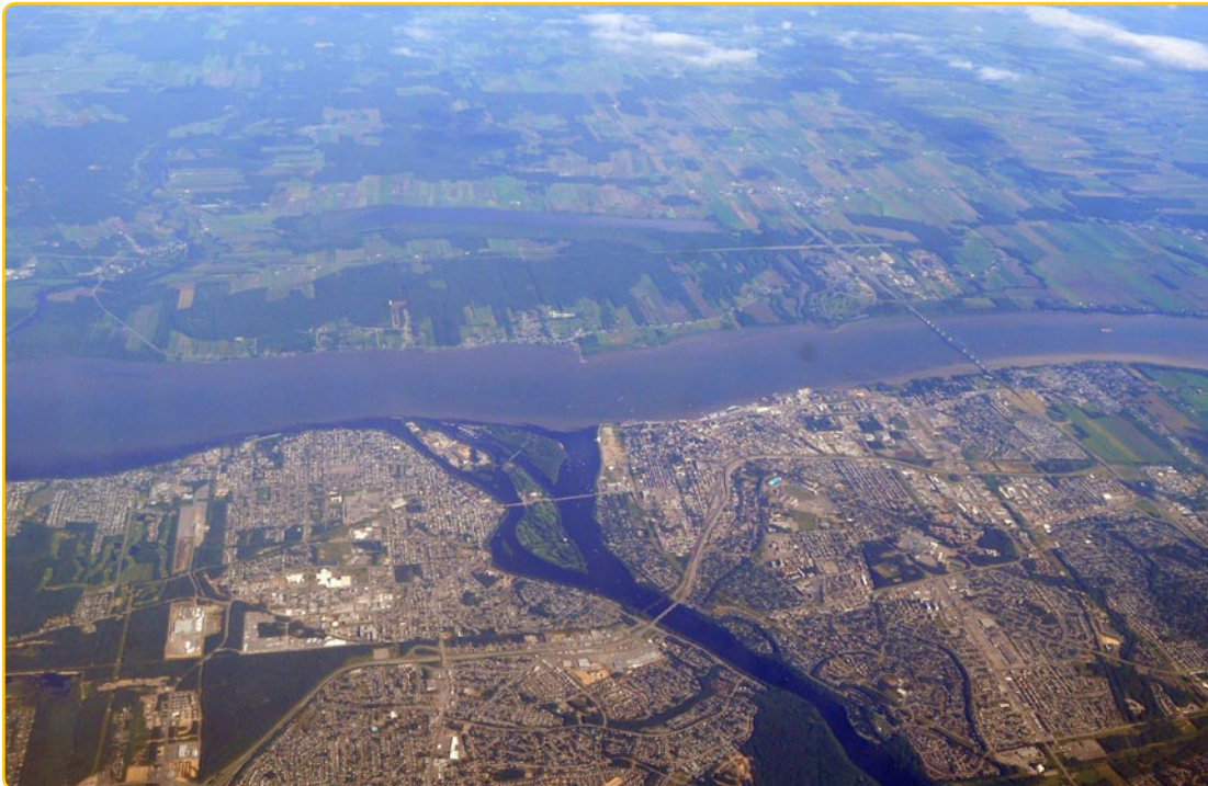
Rivière Saint-Maurice enters the St. Lawrence River at Trois-Rivières.

A diluted bitumen spill in any of these tributaries, or directly in the St. Lawrence from the pipeline crossing or tankers, could have dire consequences for drinking water sources and already fragile ecosystems that fish, migratory birds and marine animals depend on. A spill threatens to have cascading impacts, including economic losses for farmers, the robust tourist industry, and fishers that depend on the waters.