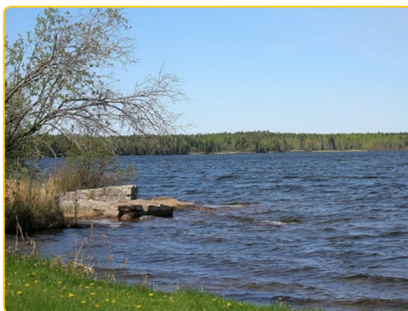
Falcon Lake Manitoba.

The pipeline path runs alongside Falcon Lake and near High Lake, which straddles the Manitoba-Ontario border. Both small lakes drain into Shoal Lake, which supplies Winnipeg's residents (600,000 residents) with their drinking water. 48 A spill in this area would further compound the water issues being faced by Shoal Lake #40 First Nation. The aquaduct from Shoal Lake to Winnipeg required a canal, which effectively severs the community's access to nearby land, creating human-made water isolated conditions. This was imposed on the reserve by the Canadian government 100 years ago. Despite being a short distance south of the busy Trans Canada Highway at the Manitoba/Ontario border, Shoal Lake #40 First Nation remains without secure road access, is denied normal economic opportunities, and has been on a boil-water order for more than 17 years. 49