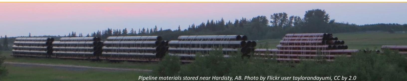
Pipeline materials stored near Hardisty, AB.

Loyalist Creek, Ribstone Creek and Monitor Creek