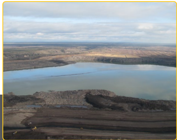
A tar sands tailings pond.

This report focuses on the spill risks Energy East poses to waterways along the pipeline path.