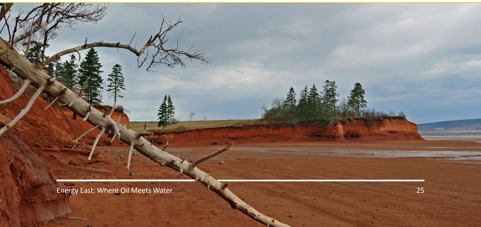
Low tide on the Bay of Fundy.

The Bay of Fundy is a 270 kilometre-long ocean bay. It hosts a diverse mix of national and provincial parks and national historical sites, and attracts an average of 1 million tourists each year.